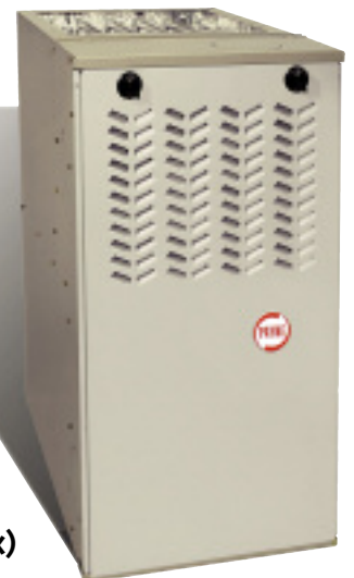
Models PG8M / PG8J (Low NOx)

No matter which model you choose, you can expect comfort and savings to continue for years because Payne products are designed, built and tested for long lasting operation.