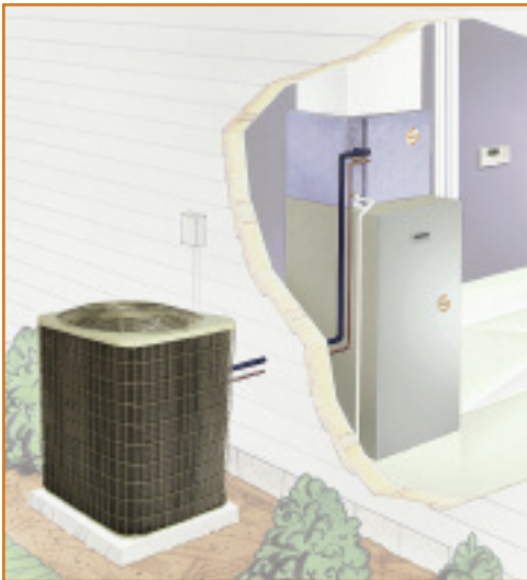
Air Conditioner and Gas Furnace System

An energy-efficient Payne furnace provides welcome warmth during winter's blustery chill. Add a Payne central air conditioner and properly matched evaporator coil and you can count on cool, soothing relief from summer's heat as well. It's a total system solution for indoor comfort you can count on all year long.